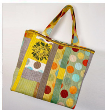
Quilt as you go