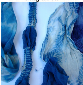
Shibori (Indigo) dyeing